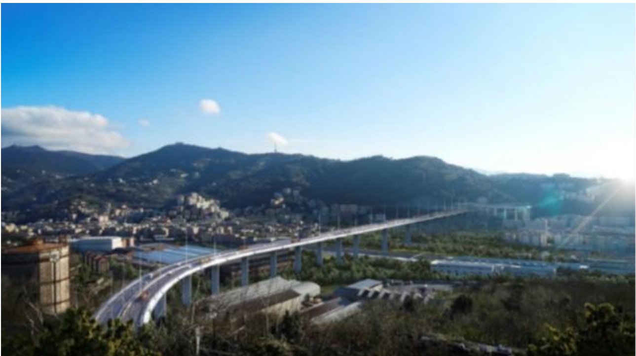
Figure 1. The San Giorgio Bridge in Genoa is equipped with an advanced monitoring system, which also includes two robots (from INGENIO).

Efficient monitoring should be based on a large number of sensors, which should be both reliable, to obtain useful data, and low-cost to be able to predict large-scale use. The use of terrestrial radar interferometry has become more widespread in the last decades. Despite the difficulties in analyzing data and interpreting the results, these measurements have the indisputable advantage of not installing tools on the structure or requiring direct access on it.