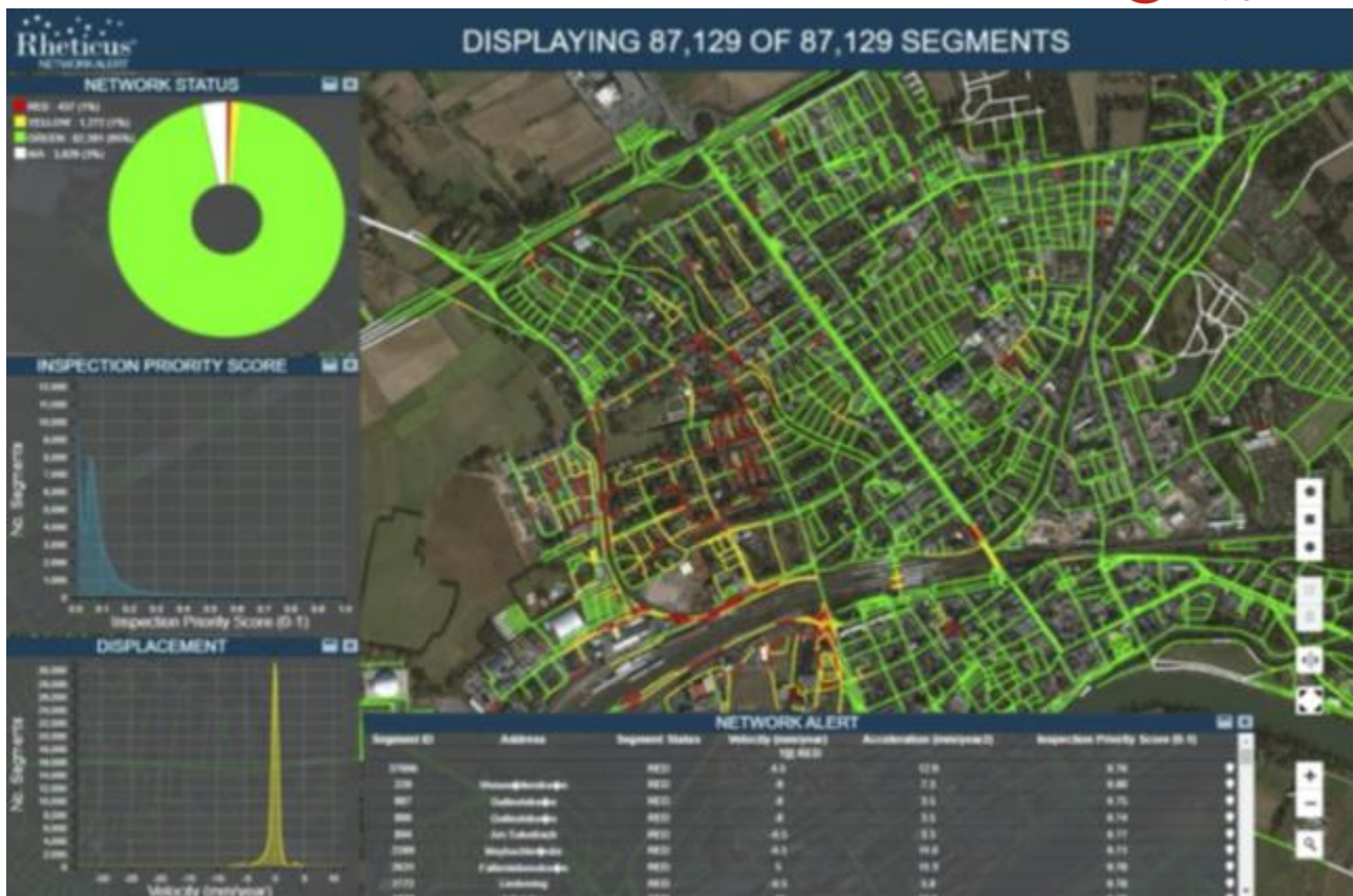
Figure 4. Demo Rheticus® Displacemet Platform (Planetek UK)

Rheticus can adopt the same application to monitor bridges and viaducts over wide areas, even regional ones. It would be desirable to monitor the entire national territory, with considerable savings of economic resources and time. The objective is to detect any displacement due to subsidence or uplift, keeping under control the infrastructures and the surrounding area, allowing to decide quickly where to intervene with a more detailed analysis.